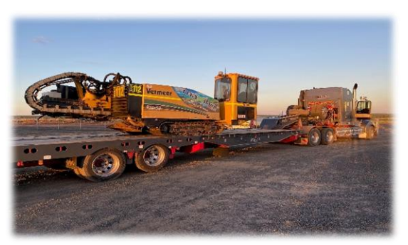
Goonyella Riverside technology enabling project