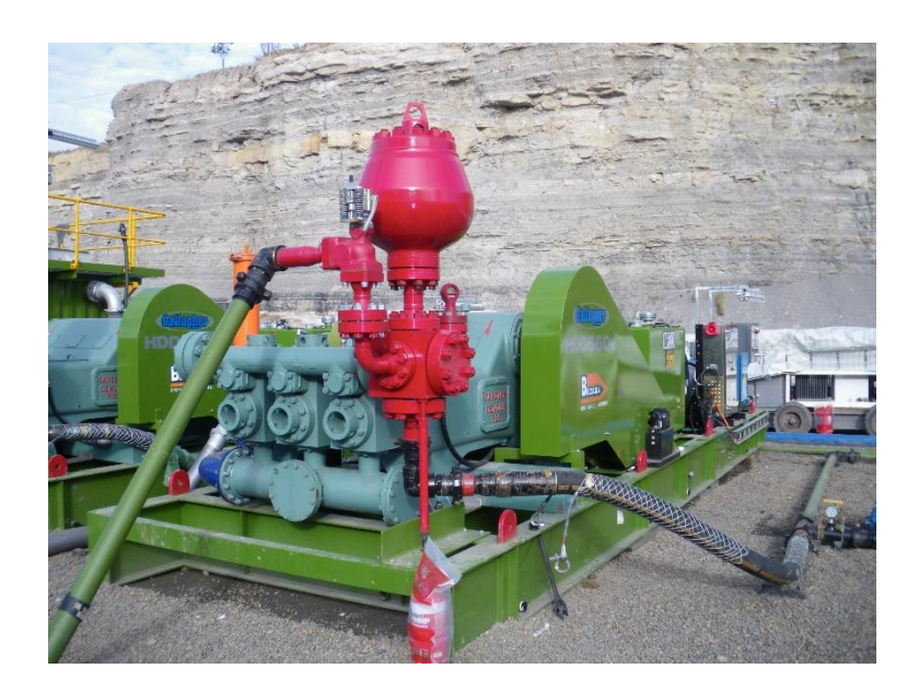
Gardner Denver PZ8 Pump

Maxibor has used its extensive knowledge and innovation to extend one of its Vermeer 100x120 drill rigs so that it can take up to 9.6m drill pipe thereby allowing the drill to ream out to a larger diameter especially in hard ground conditions. Vermeer 100x120s, or similar sized rigs, unless extended to take the long rods, are limited in the size they can expand bore holes to in hard ground conditions due to the greater wrap/flex of the conventional smaller rods.