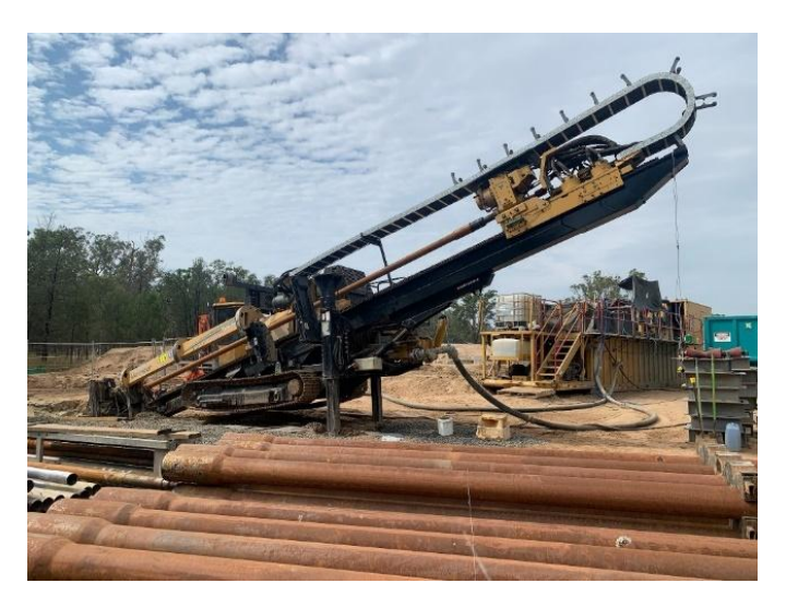
Extended Vermeer 100x120

The extended Vermeer 100x120 now effectively has the same capacity of a maxi-rig with a smaller site footprint and lower operational cost.