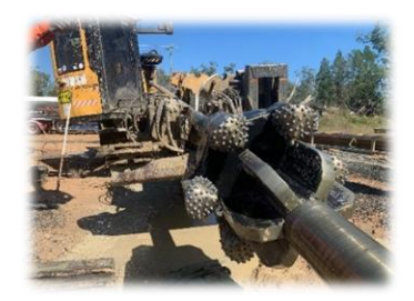
Vermeer 100x120 with rock cutter

Maxibor has 7,000 metres of 7,000 metres of 5" drill pipe and 4,500 metres 6 5/8" drill pipe along with a range of cutters and reamers for any sized bore.